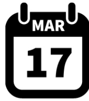
THE NUMBER 17