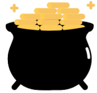
POT OF GOLD