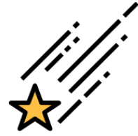
MAKE A WISH